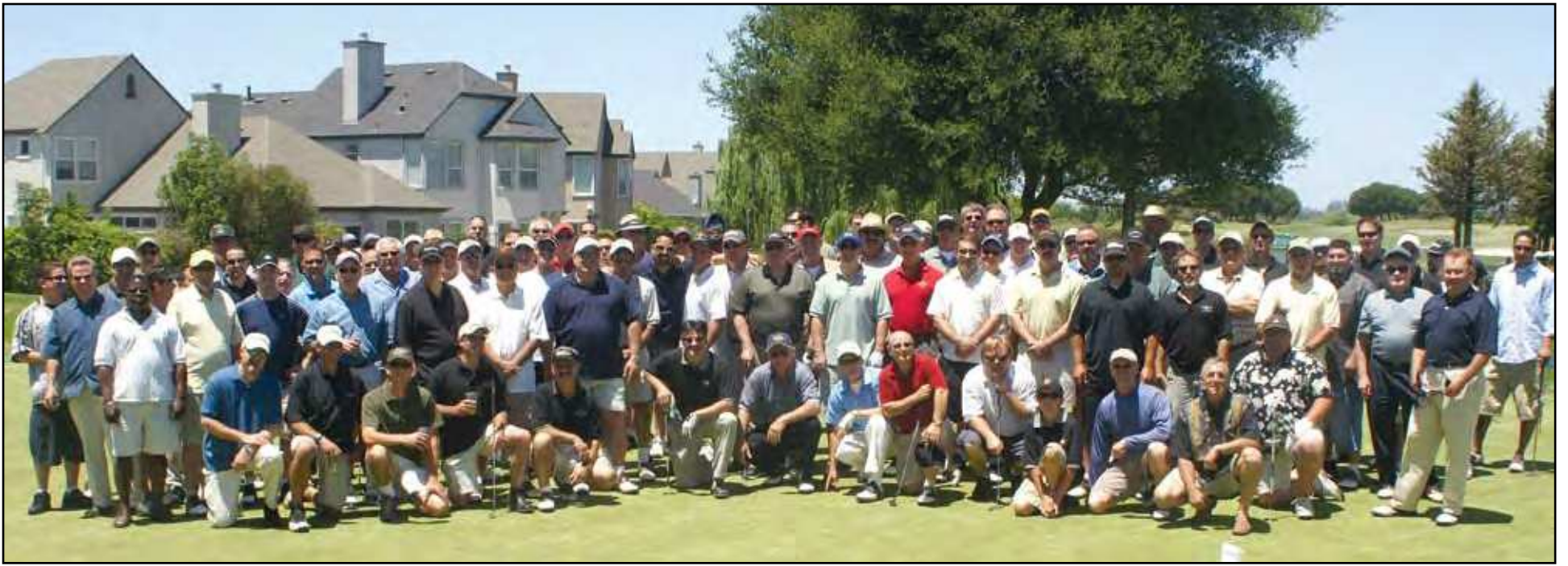
More than 140 players gathered at the Annual Local 38 Charity Golf Tournament at the Adobe Creek Golf Course in Petaluma last month, helping to raise over $17,000 for the fight against domestic violence.