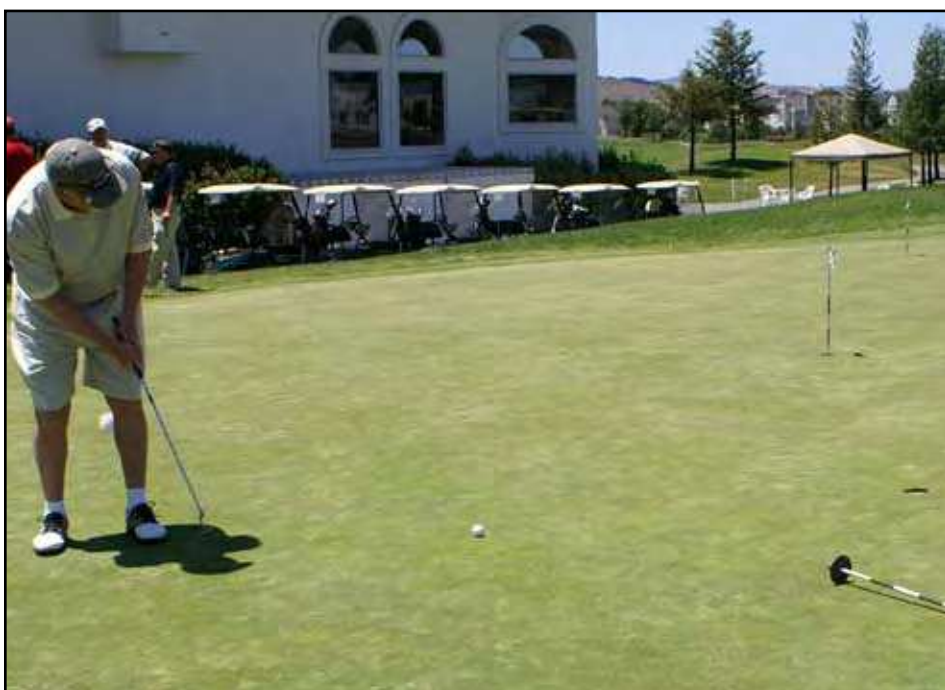
One of the most consistently popular events of the entire Local 38 Golf Tournament is the putting contest. Entrants pay $5 for a shot at winning $5,000. To win a competitor must sink three putts, each one successively longer than the previous one. Despite numerous entries over the past two years, nobody has actually won the grand prize, although some have come close. Still, there's never a shortage of those willing to try.