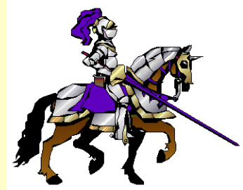
Lake Havasu High School Knights