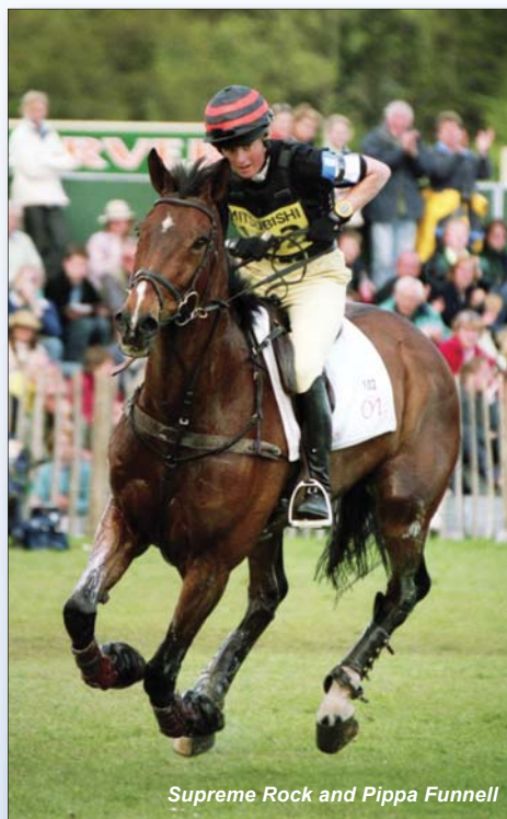
Supreme Rock and Pippa Funnell

My all-time favourite horse who won back-to-back Badminton in 2002 and 2003 and consecutive European titles in 1999 and 2001. Pippa and Rocky were part of the silver medal-winning team at the Sydney Olympics in 2000 and they, with the excellent Primmore's Pride, won the most valuable Eventing prize of all time, the Rolex Grand Slam in 2003.