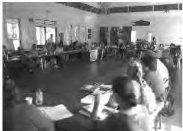
The two-day annual meetings of the 'Ohana have drawn large crowds with lively discussions that have ended with the overall feeling of unity and aloha.