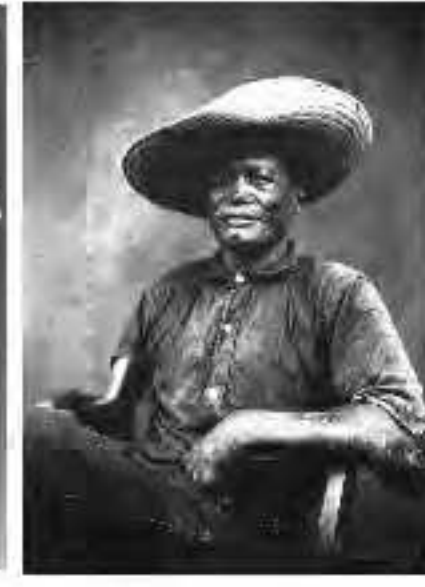
This man wearing a hat may be unknown at this time, but he is part of Ka 'Ohana O Kalaupapa. Maybe someday we will learn who he is – and perhaps find his family.

"I bring my past with me, our lives are the message that we give. All the kids I grew up with in Kalaupapa. In honoring our past, it behooves us to bring honor to them. I honor them. I honor everyone else. Ua pau."