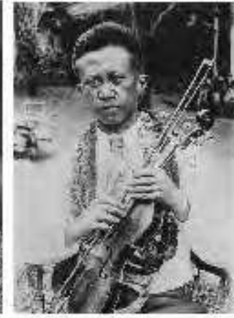
An unidentified musician from Kalaupapa's past, draped in leis, poses with his elegant violin. Ka 'Ohana O Kalaupapa was formed to honor and to perpetuate the memories of all the 8,000 people who were exiled to the peninsula.