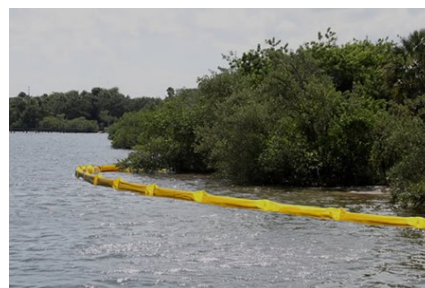
Installed Debris Boom

Step 6 (Anchoring): If applicable, anchoring along the length of boom is done by attaching the anchored buoy to the curtain through the use of a painter line. This line should connect to anchoring points or section connectors located along the barrier. Buoys should be anchored into position prior to connection to the barrier. Anchoring placement is designed based on your water conditions and will typically be reserved to moving water applications.