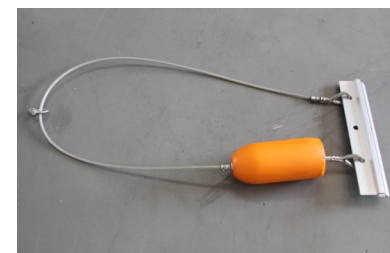
Tow and Anchor Bridle (not included)