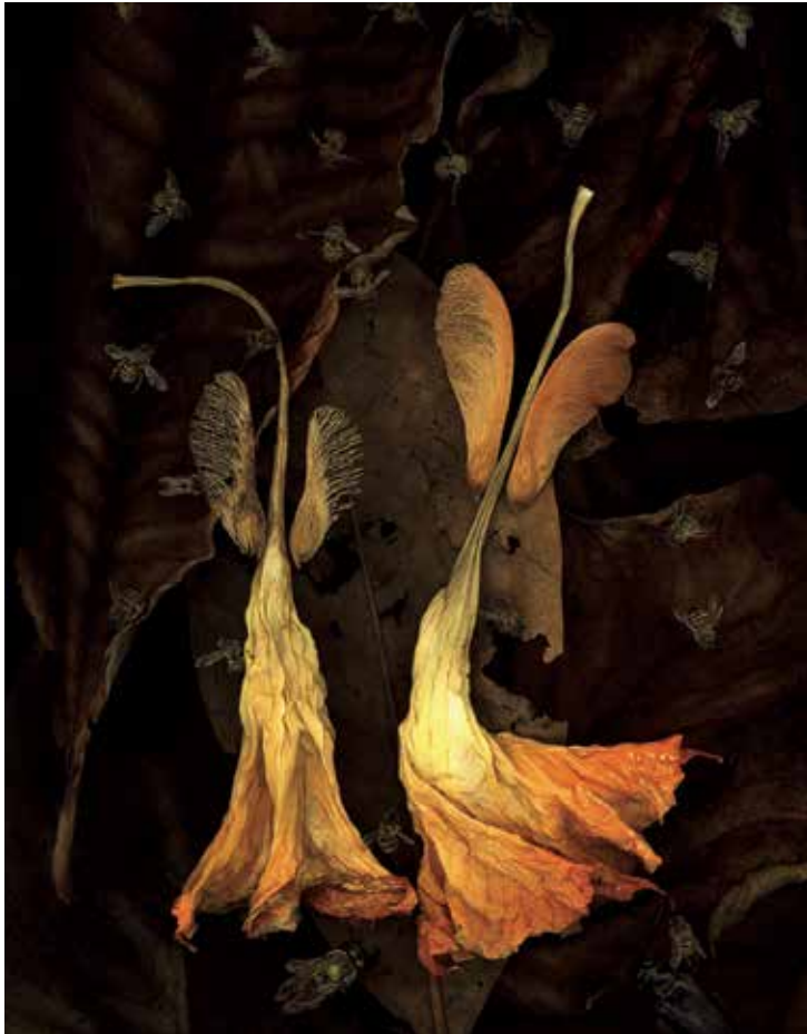
The Leaves of Past Mixed media, 18" x 23"

Create something new and exciting. Work side-by-side with world-class visual and performing artists. Study both traditional and cutting-edge art forms. Engage in the life of your community through creation and performance. Explore your art form's boundaries.