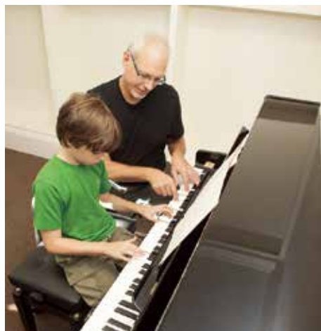
by Stephen Sweny

60 minutes: $230 members/$240 non-members