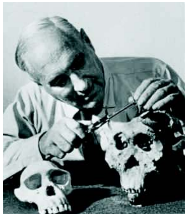
Louis Leakey with Zinjanthropus

The Hope of Israel Ministries Bible Correspondence Course will continue to bring you these facts. Prove them by the Bible and TRUE science so you’ll KNOW that you KNOW THE BIBLE ALWAYS MEANS EXACTLY WHAT IT SAYS!