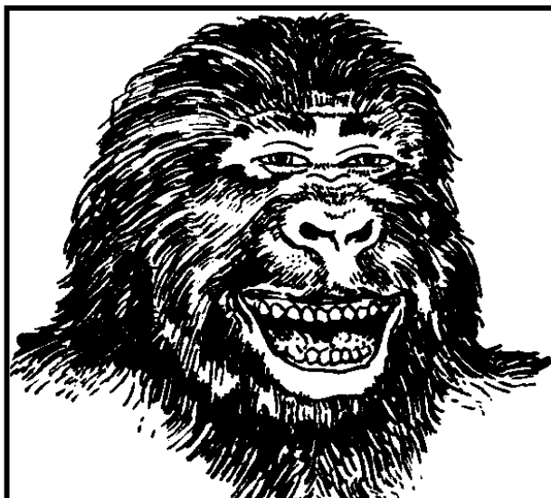
Zinjanthropus as drawn for prominent scientist.

coloring? In this connection evolutionist Le Gros Clark, in The Fossil Evidence for Human Evolution , observes: