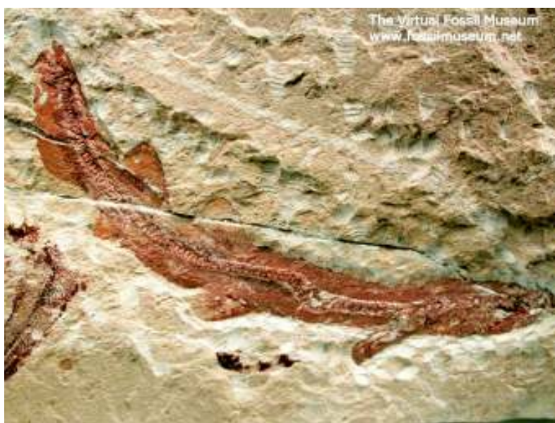
This fossil shark, found preserved with its skin, was buried SUDDENLY in a stratum formed during pre-Adamic destruction of the earth.

There is abundant, absolute proof of the RAPID succession in which the pre-Adamic strata were deposited -- evidence which evolu-