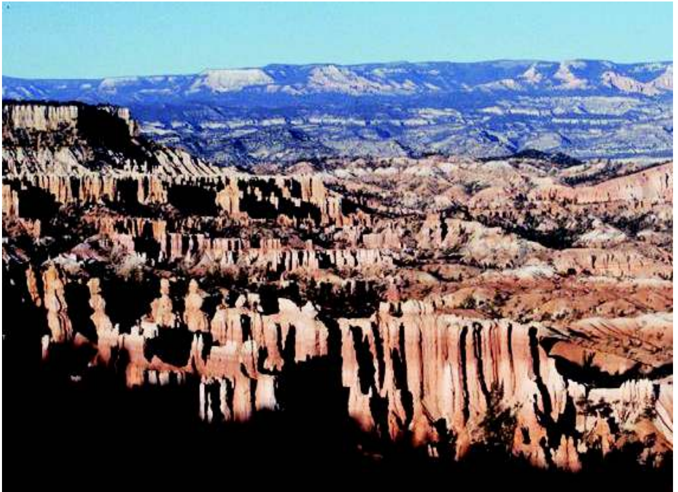
A Record in Stone