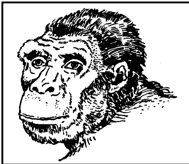
Zinjanthropus as drawn for Sunday Times , April 5, 1964.

Are the drawings and figures of man’s so-called ancestors really scientific? Can it be determined what a fossil really looked like, that is, what its facial features were, the skin, hair and