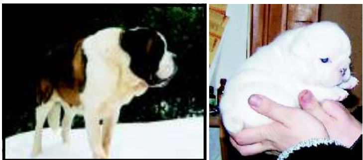
Above, huge St. Bernard and tiny Mexican Chihuchua are striking examples of YEHOVAH-ordained variations possible within the Genesis dog “kind.”

Now scientists have learned that NEW VARIETIES of Genesis “kinds” of life which live in the air, sea, or on land, may be produced. About the year 1900, Hugo de Vries, experimenting with the primrose, found that from this primrose KIND came many NEW VARIETIES OF PRIMROSES that he had never seen before. They arose “SUDDENLY, spontaneously, by steps, BY JUMPS. They JUMPED