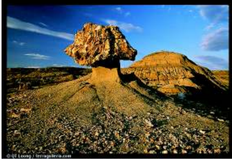
Petrified log in the Theodore Roosevelt National Park, North Dakota, USA. Flood water erosion left log resting on natural earth pedestal.

All the flood deposits of Noah's time are THIN and SCATTERED over the surface of the earth. Geologists call these deposits "Cenozoic."