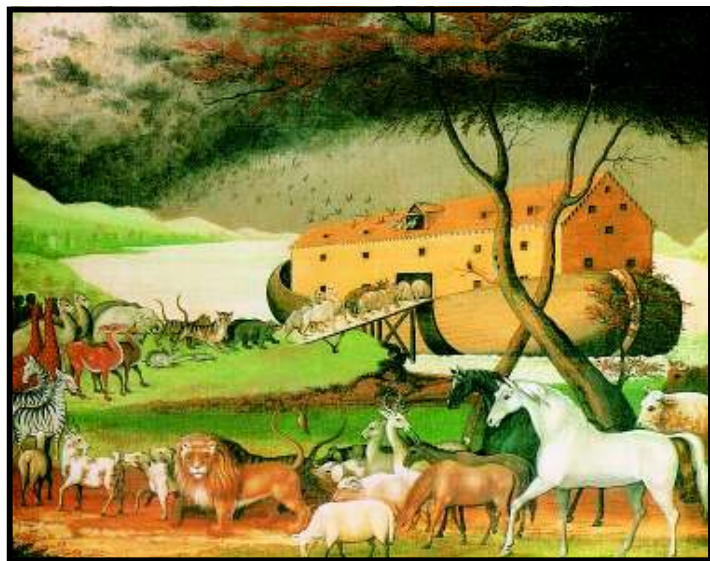
Artist's conception shows pairs of Genesis "kinds" arriving at Noah's Ark to be preserved through the flood.

VARIETIES of birds, dogs, cattle even people, today! This also explains why YEHOVAH God could command Noah to put all known "kinds" of living creatures into the ark. For there were still relatively FEW Genesis "kinds" in Noah's day. Since that time these "kinds" have produced GREAT NUMBERS OF VARIETIES!