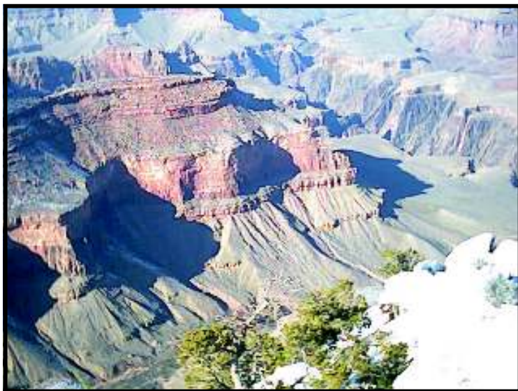
View of Grand Canyon from Yavapai Point in Arizona. Spectacularly defined are layers of stratified rock that were laid down successively during the pre-Adamic destruction. Some layers are more than a mile thick!

DAYS -- NOT thousands, or millions of years!