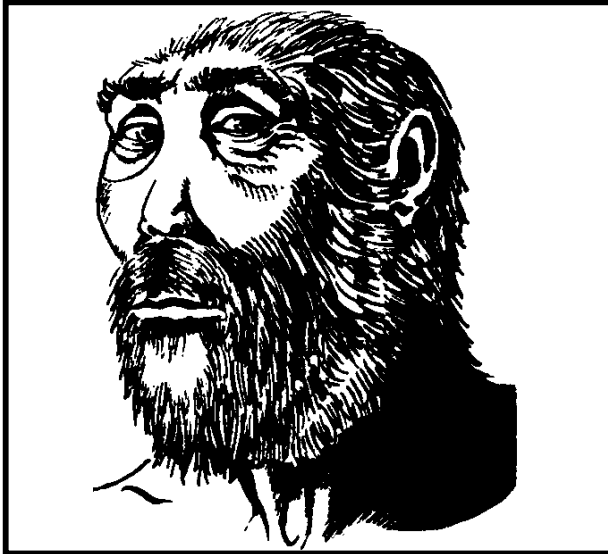
Zinjanthropus as drawn for National Geographic , September 1960.

remains , minor racial groups with less distinctive characters” (p. 54).