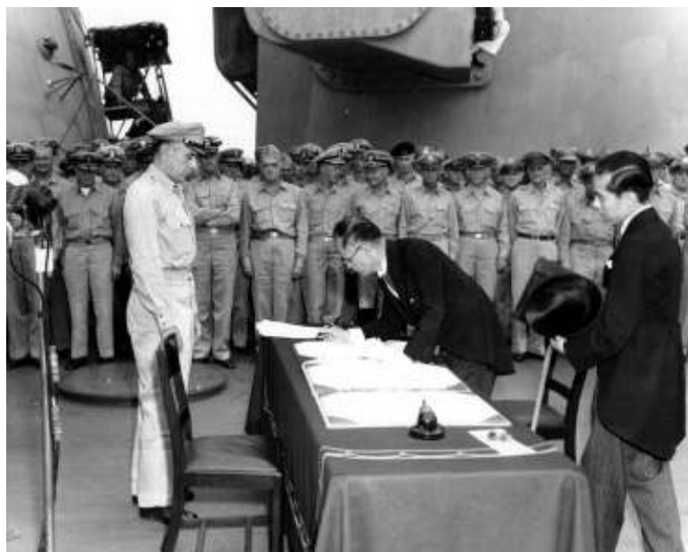
Japanese delegation signs World War II unconditional surrender documents aboard the USS Missouri, September 2, 1945. Mankind is at war with YEHOVAH God and must surrender unconditionally to Him!

War to the DEATH -- and I mean ETERNAL DEATH, or else to ETERNAL LIFE. And you must choose which. You cannot have both.