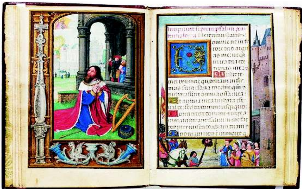
The Power of Prayer!

A Book of Hours, published about 1510-20, showing King David praying to YEHOVAH God after his adultery with Bathsheba. Alongside the picture is Psalm 6.