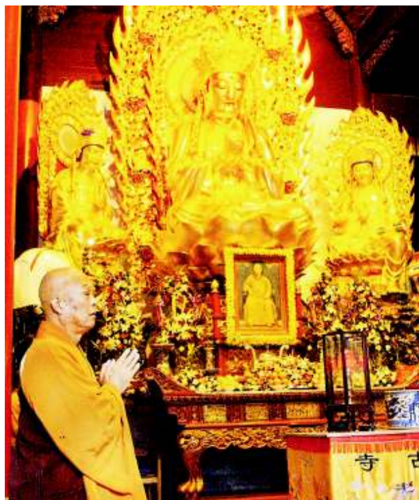
Buddhist monk praying to a dead pagan god that cannot answer prayer!

1. Did the apostle John admit that all of us -- including Christians -- still commit sins and come short of YEHOVAH's glory? I John 1:8 and Ecclesiastes 7:20 compared with Romans 3:23. If we say that we do not sin, are we DECEIVING ourselves? Same verses. Then isn't it plain we, of ourselves, cannot overcome our evil nature and achieve membership in