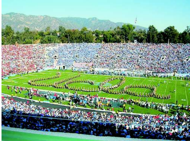
Crowd viewing half-time show at a football game in the Rose Bowl, Pasadena, California. A great deal of human nature is expressed at such events.

When YEHOVAH God created MAN, He formed man of the DUST OF THE