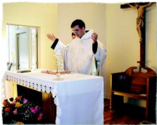
Catholic priest in ritualistic prayer that is abhorrent to YEHOVAH God.

The glory of YEHOVAH's Kingdom can be attained only with YEHOVAH's personal