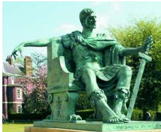
Bronze statue of Constantine in York Minster, England, near the spot where he was proclaimed emperor in 306 A.D.

granted to the rider ‘to take peace away from the earth,’ what could this mean but war, bloody war? So, then, when the Gentile Times ended in 1914 and the Rider on the white horse did ride forth, was this event marked by bloody war?