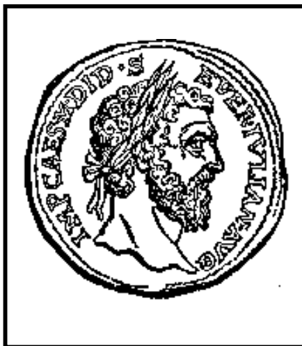
Above -- A coin of Emperor Julianus. To the Left -- Emperor Julianus. Some think he was emperor at the time of the Red Horse.

As is the case with the White Horse, there appears to be NO END to the GUESSES or "interpretations" available for this Red Horse. Notice this novel approach from the Internet --