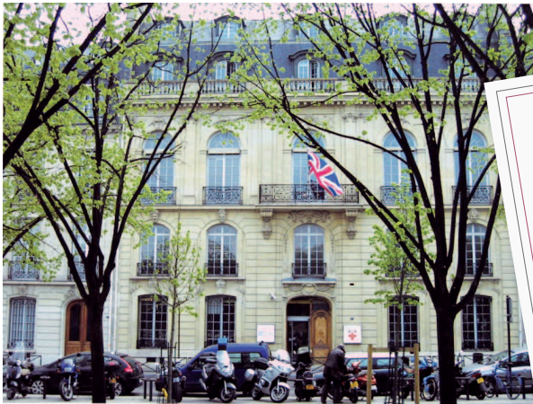
British Council, Esplanade des Invalides

On receipt of your payment, an official invitation card will be posted to you. The invitation card must be presented at the entrance for a security check on arrival at the British Council.