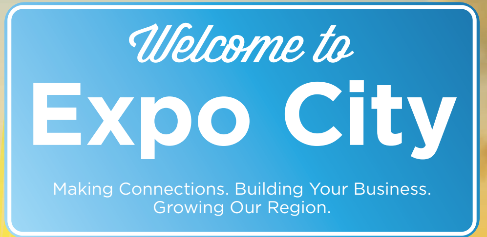
2014 Business Expo Theme