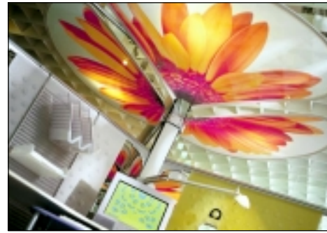
Herman Miller Resolve overhead canopy

Herman Miller's Design on Textiles capability gives our clients design possibilities they've never had before in any systems product. Available on the ground breaking Resolve System , Design on Textiles lets customers choose and create digitally printed designs for their Resolve boundary screens, rolling screens, flags, and canopies.