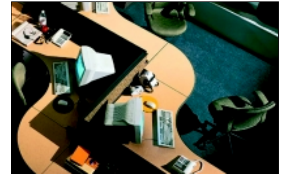
Herman Miller Passage Corner links and extended corner worksurfaces connect to create this flowing attractive teamwork area.