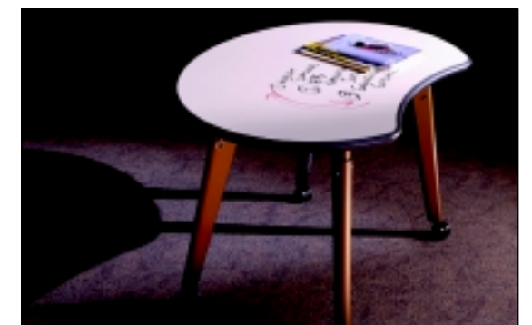
Passage height adjustable mobile tables are available with a marker board top option that allows people to write and erase on the table top during meetings.