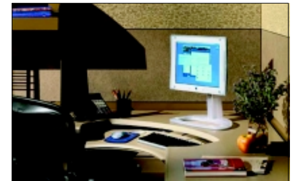
This Passage corner desk module with input platform has two independent surfaces so no keyboard tray is needed for comfortable, ergonomic computer work.