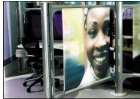
Herman Miller Resolve Boundary Screen

This capability opens up new dimensions in workplace design and it gives your company a new way to express its image, culture, or identity. Your company can express itself by displaying corporate logos, slogans, and colours throughout the office. Screens or flags could identify departments and help in wayfinding. People, products, and artwork can also be featured. In other words, you can use your furniture to communicate whatever message or image you like.