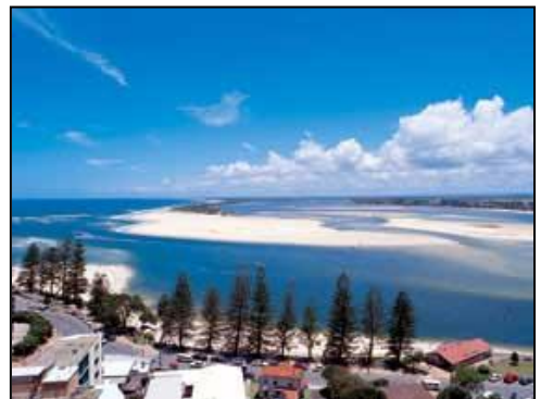
View from Centrepoint Apartments, Caloundra