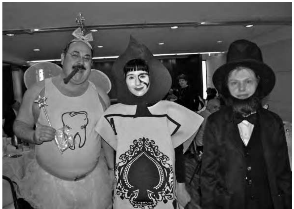
Purim Party Costume Winners