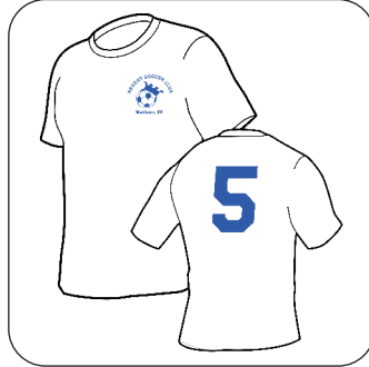
Regent SC White T-Shirt

[ ] YS [ ] YM [ ] YL [ ] AS [ ] AM [ ] AL [ ] AXL