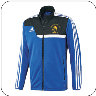
Regent SC Royal Tiro 13 Jacket

[ ] YS [ ] YM [ ] YL [ ] AS [ ] AM [ ] AL [ ] AXL