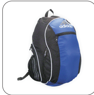
Regent SC Royal Estadio II Backpack