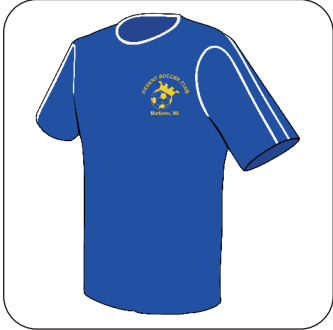
Regent SC Royal Columbus Jersey

[ ] YS [ ] YM [ ] YL [ ] AS [ ] AM [ ] AL [ ] AXL