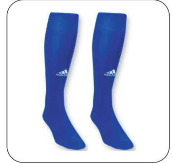
Regent SC Royal Metro Sock

[ ] EXTRA SMALL [ ] SMALL [ ] MEDIUM [ ] LARGE