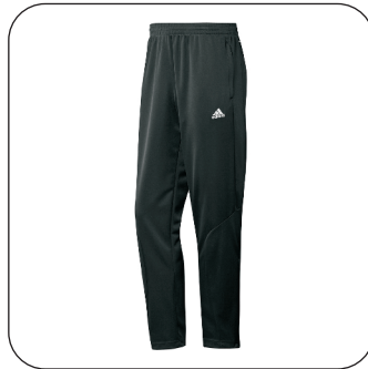
Regent SC Black Sereno 11 Pant

[ ] YS [ ] YM [ ] YL [ ] AS [ ] AM [ ] AL [ ] AXL