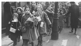
Children arriving in England from Vienna by Kindertransport in undated photograph.