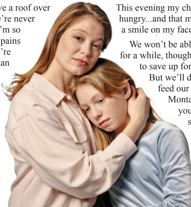
Photo has been changed to protect the identity of the client

Thank you for your generosity. I don't know what we would do without your caring and compassion.