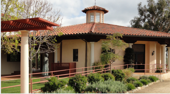
February 27, 2013 Serra Retreat Center Malibu, CA