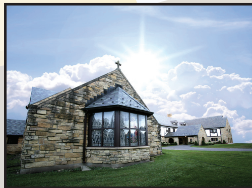
Guest House Treatment Center located in Rochester, Minnesota

Guest House is the founding behavioral health and addiction treatment program for men and women Catholic clergy and religious. For more than half a century Guest House has provided personalized clinical treatment with a spiritual emphasis, with a goal of returning every religious person to his or her ministry and mission rapidly and successfully. The accredited, full-time clinical staff is on-site at two secure, private rural residential treatment facilities.