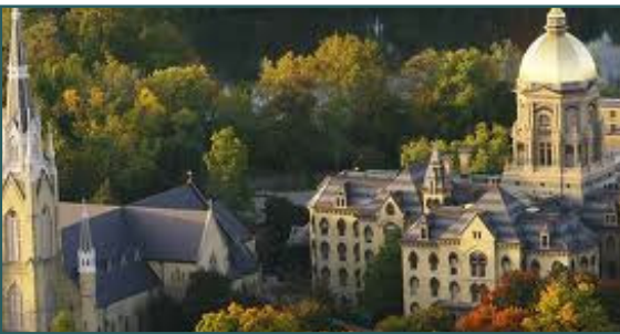
October 10, 2013 Notre Dame University Notre Dame, IN