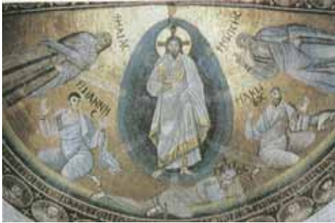
St Catherine's Monastery, Sinai (c. 565 A.D)

The earliest surviving image of the Transfiguration is from St Catherine's monastery in Sinai, a place which, because of its seclusion, is home to many early icons. In the apse of the catholicon there is a mosaic of the Transfiguration, dating from the middle of the sixth century.