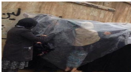
The vote took place amid heavy rain rainfall in many areas