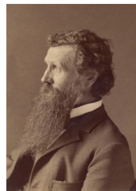
JOHN MUIR 1890