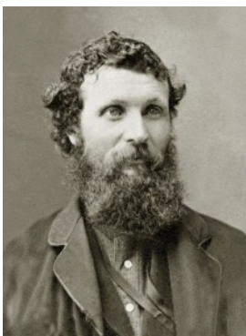
JOHN MUIR 1867

Nearly 100 years ago, on Christmas Eve 1914, an elderly gentleman, born in Dunbar in 1838, died in hospital in Los Angeles and the news was carried in all the major newspapers in the United States. He had helped to preserve huge areas of America's wilderness and is regarded as the ' Father of the US National Parks '. He was also the founding president for 22 years until his death, of America's foremost environmental organisation the Sierra Club , and is now considered one of the founders of the World's conservation movement.