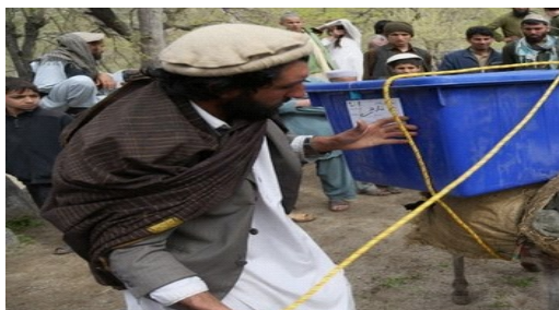
In many parts of the country donkeys were deployed to take ballot boxes to remote areas