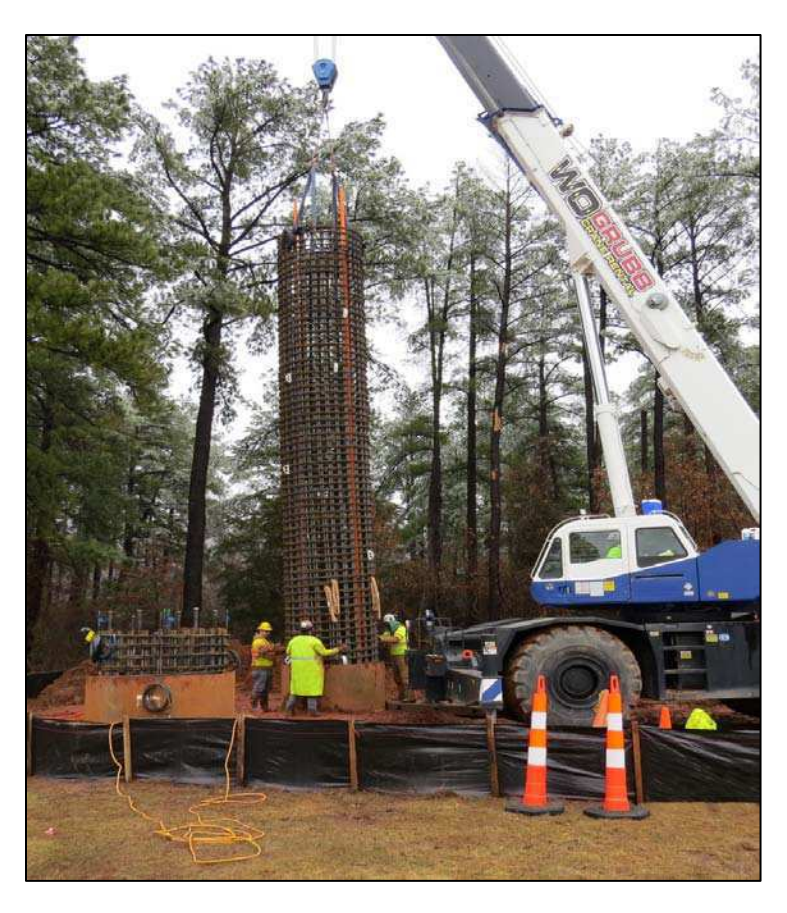
Once in the ground, concrete will be poured around these rebar cages that will reinforce the test shafts.