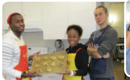
Mtn. Home AFB groups – challenged each other to a cookie bake off