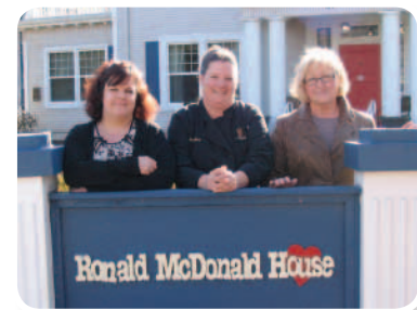
Simplot – prepared dinner and made main and side dishes to be frozen and used in the future