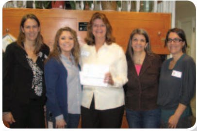
Scentsy check presentation – Funds provided by Scentsy through their employee volunteer service program