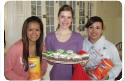
AVID – group baked treats, cleaned, and sanitized the palyroom toys