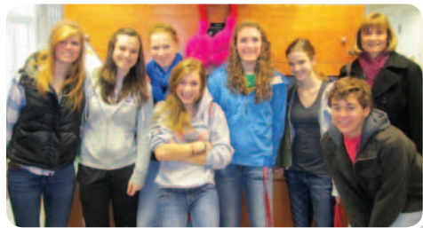
Boise High Spanish Club – preparados de pollo sopa de tortilla, sopapillas, y jarittos para la cena