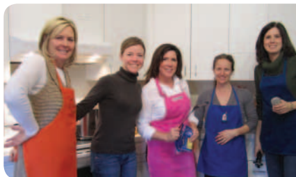
Junior League of Boise – scheduled several shifts so all members were involved