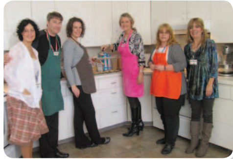
St. Luke's Financial Services – prepared cookies in lieu of financial statements