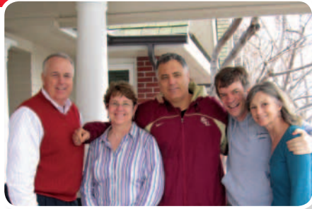
ConAgra Foods Lamb Weston – held a BBQ for families, volunteers and staff