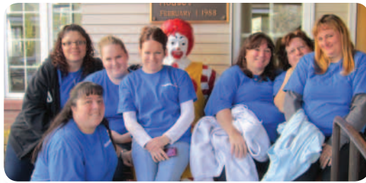
Wal-Mart group – organized the pantry, unpacked donations, moved items to garage