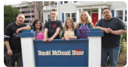
Scentsy group – made lasagna and some tasty side dishes