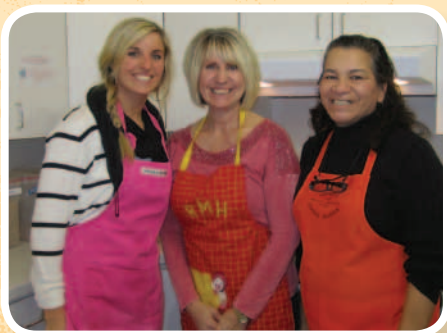
Target group – prepared a delicious Italian feast