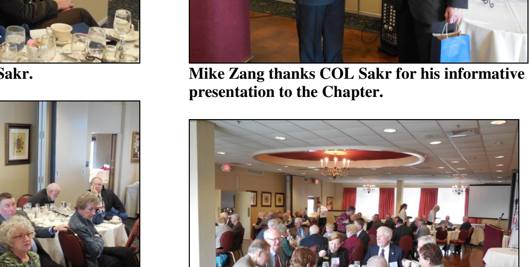
A good time was enjoyed by all.