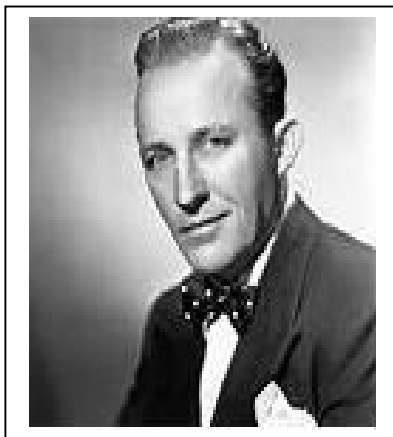
Line of Descent

Among the descendants of William Brewster is Actor Bing Crosby.