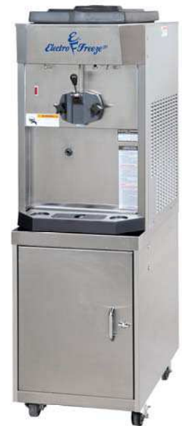
Shown with Optional Cabinet