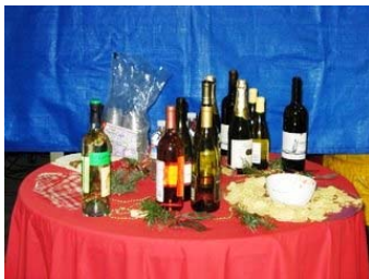
Above, MB99s schmoozing and eating at the annual Holiday Party.