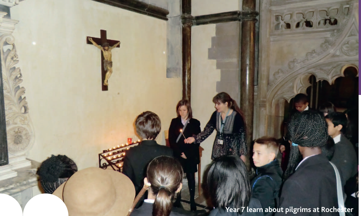
Year 7 learn about pilgrims at Rochester