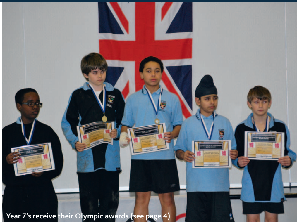
Year 7's receive their Olympic awards (see page 4)