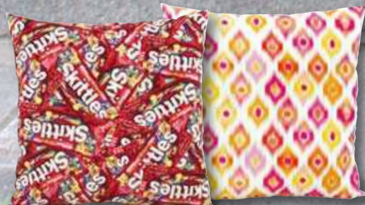
NOVELTY AND FUN PRINT PILLOWS page 16-17