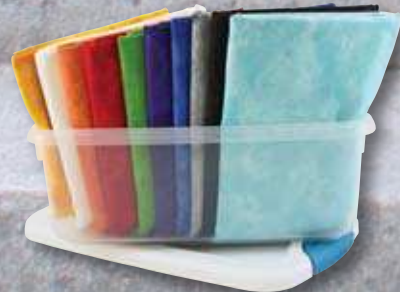
SELECT SAMPLER page 91