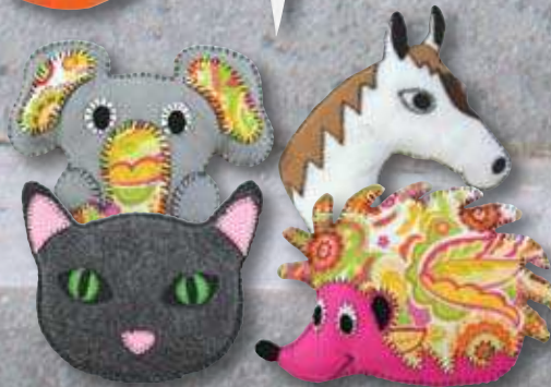
FELT FRIENDS pages 32-33