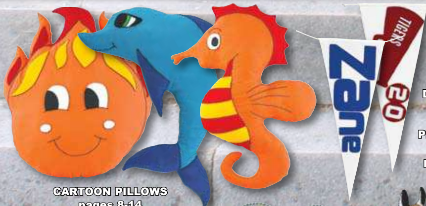
CARTOON PILLOWS pages 8-14

Call toll free: 1-800-422-6548 Fax toll free: 1-800-552-9205 Local phone: 1-765-583-4496 Website: www.haancrafts.com E-mail: sewing@haancrafts.com