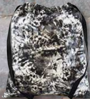
PREMIUM CANVAS LARGE BACK SACK page 56