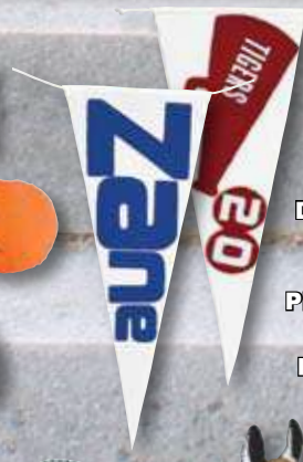
DESIGN-YOUR-OWN PENNANT KIT page 76