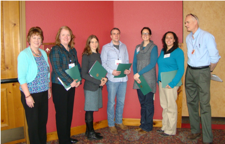
INITIATION OF NEW MEMEBERS