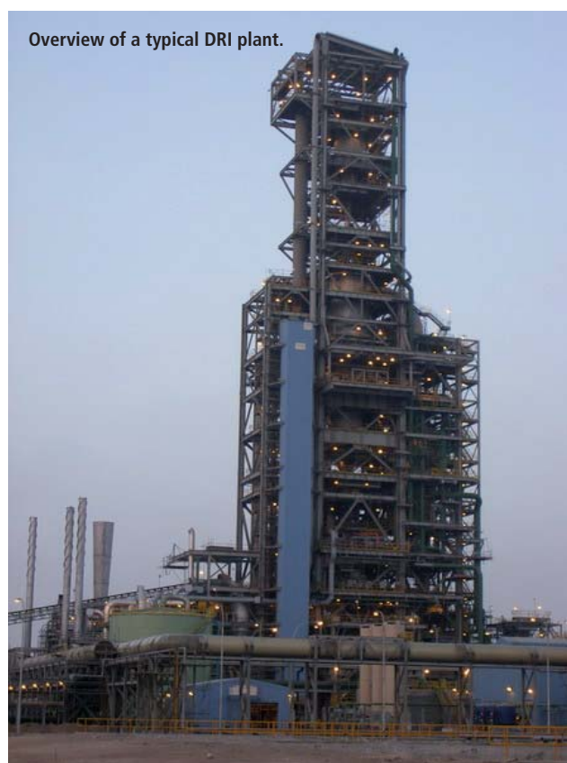
Overview of a typical DRI plant.

The production of DRI, a basic raw material for making steel, is concentrated in a few countries in the Middle East and Latin America. One primary reason for this is that natural gas, the main fuel source for most DRI processes, is available in quantities in these two regions.