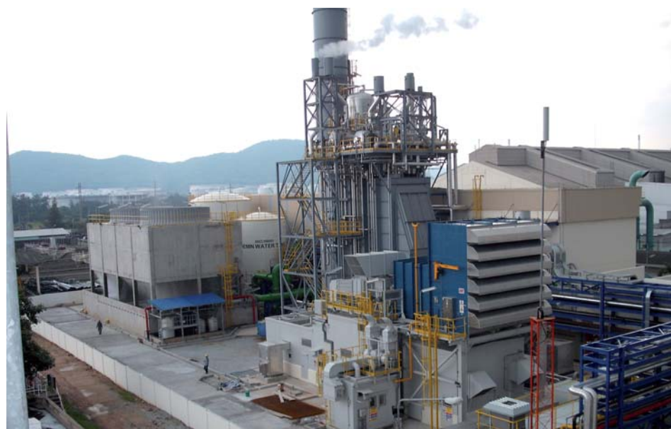
Overall view of Sime Laem Chabang Project in Thailand.