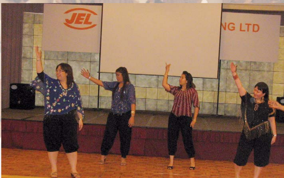
Dance performance by our JEL recreation committee.