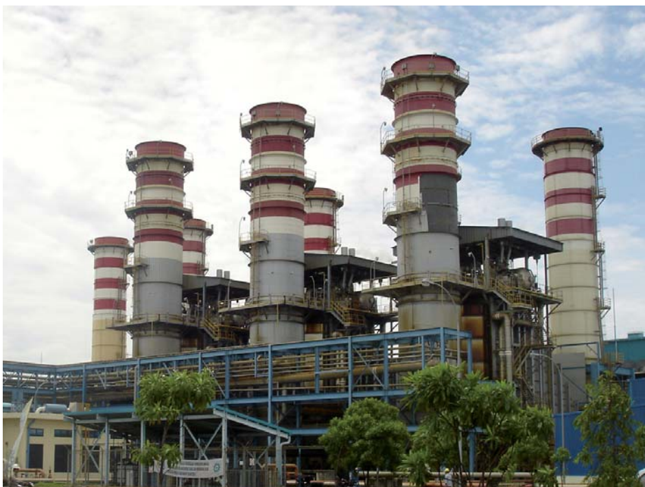
Partial view of the existing Muara Tawar gas-fired combined cycle power plant.

JEL's decades of expertise in power plant M&E work and the recent successful completion of the Tarahan project, also in Indonesia, have instilled confidence in Marubeni to award this contract.