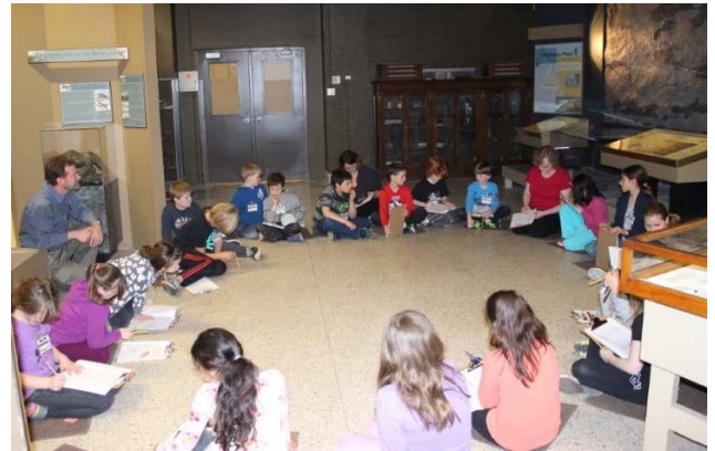
Students share journal entries amidst the collection.