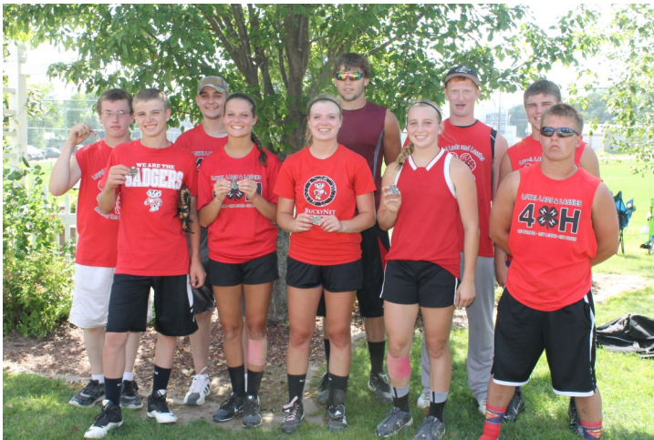
Loyal Lads & Lasses A - Team

Thank You Greenwood Lions for sponsoring the 4-H Softball Tournament