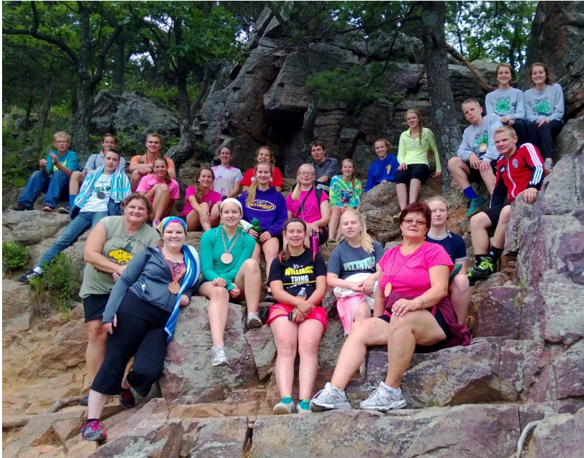
Upham Woods - Adventure Camp

Thank you to those who sent pictures in that is the pool I have to draw from!