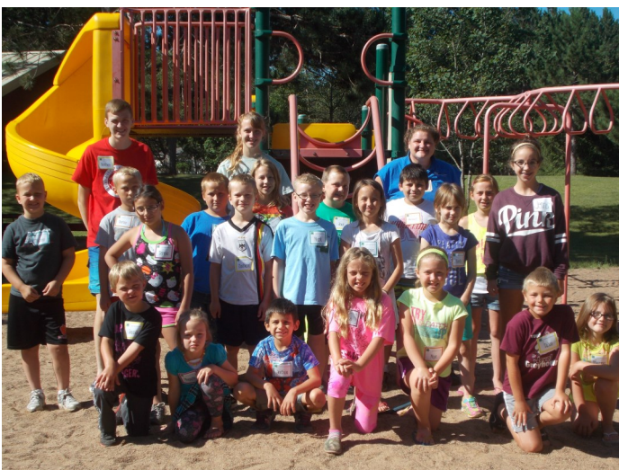
Cloverbud Day Camp Rock Dam