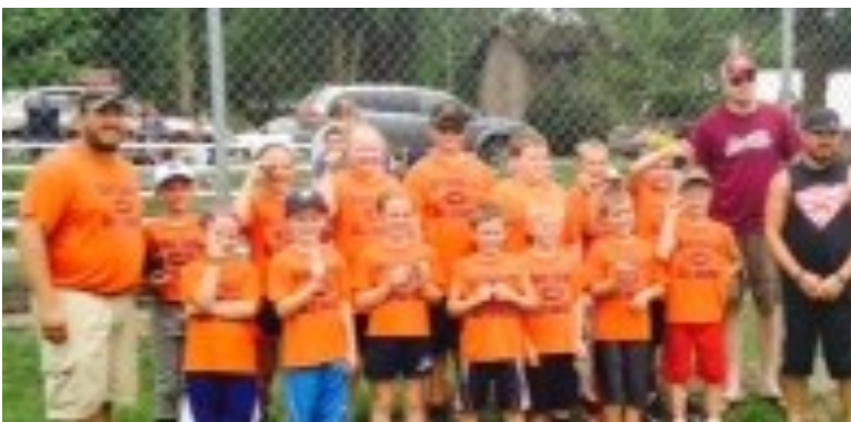
Beaver Center/Jolly Workers C - Team