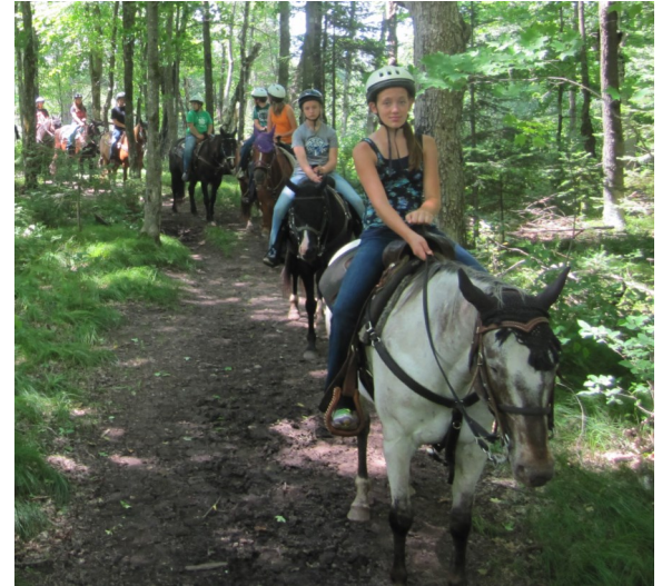
4-H members horse back riding during their In-state trip