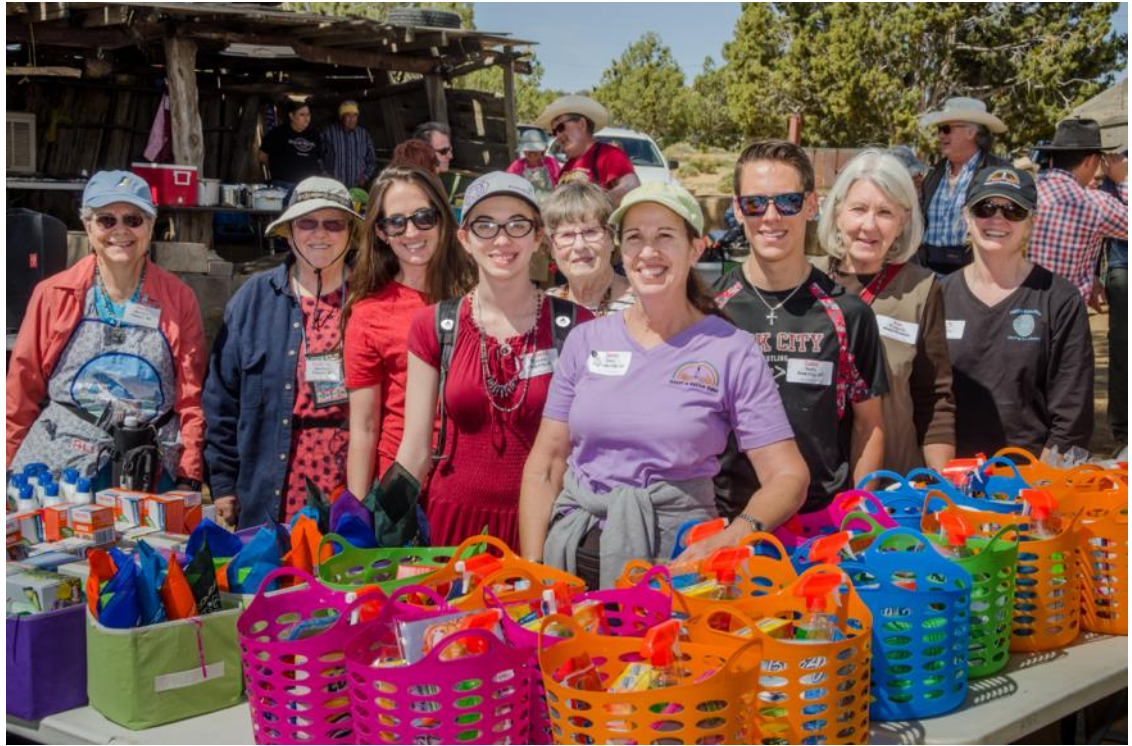
The Spring Food Run Volunteer Set Up Committee at Big Mountain