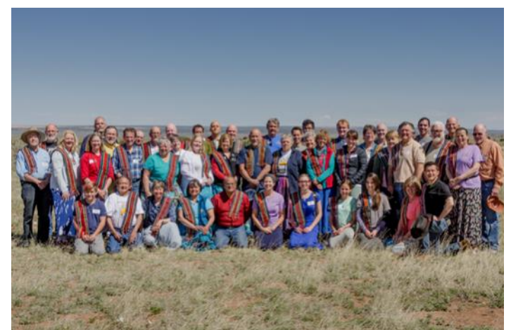
Thank you for your Sanders/Big Mountain/Teesto support.