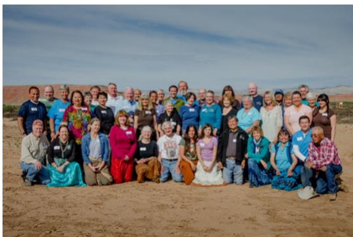
Thank you for your Many Farms/Pinion/Tsaile support.