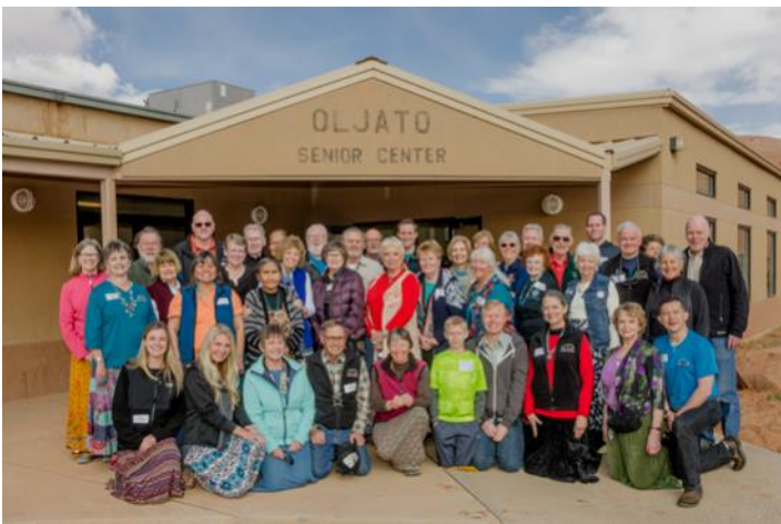
Thank you for your Oljato/Navajo Mountain support.