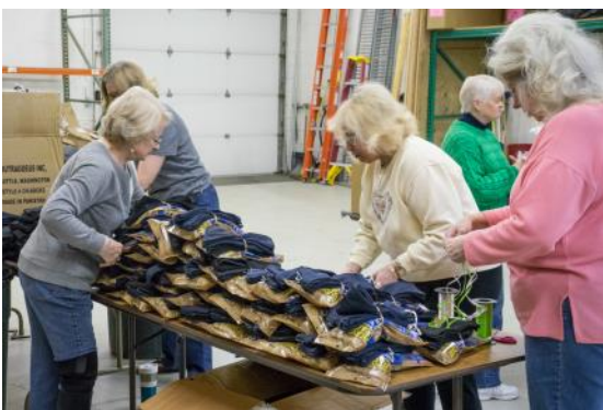
Volunteers at the warehouse donate thousands of hours throughout the year wrapping and packing giveaways.

The incredible people who take the opportunity to join us on these journeys return home with the blessings of the Elders, the deep