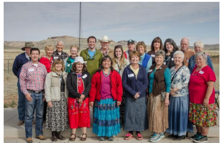
Thank you for your Dilkon/Leupp/Birdsprings support.