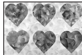
6 of Hearts by Bridget Restis

SIZE: 12" x 18" or 8 1/2" x 11" — Horizontal format (sample below).