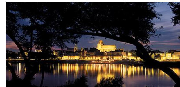
Middle picture: Warsaw; Above: Torun