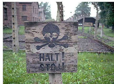
A photograph taken inside the Auschwitz (Oswiecim) Concentration Camp in Poland, Nazi Germany's largest concentration and extermination camp.

$1,950 per person, twin share. Single $300 additional. Based on min. of 3 passengers.