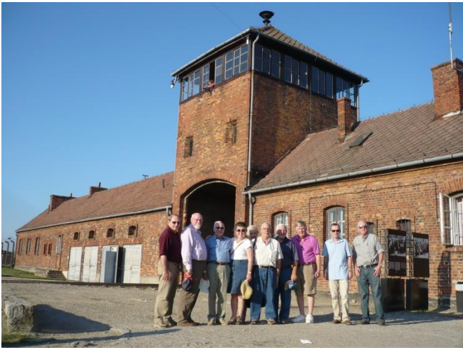
2016 tour group at