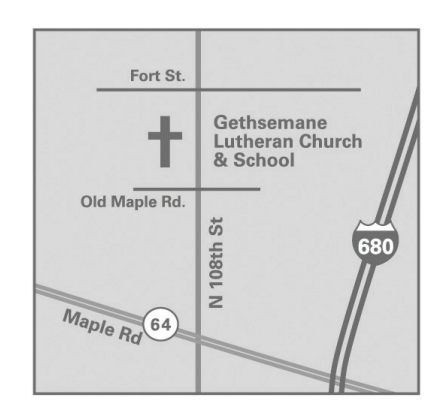
Directions: We're on the west side of 108th at Old Maple Rd.