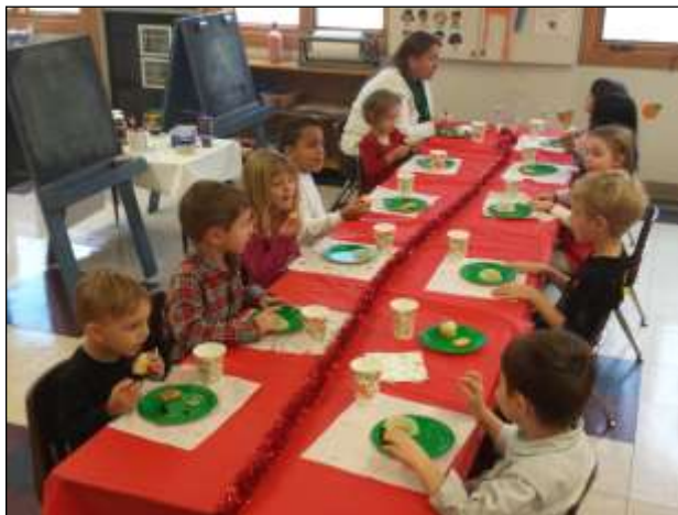
Searching for the Wise Men with Pastor