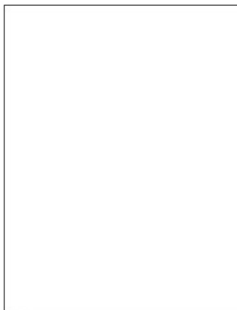
Full Page 7.5" x 10" non-bleed 8.75" x 11.25" with bleed

All advertising materials must be received by August 31, 2016 , in order to appear in the 2016 event catalog. We accept high-resolution (300 dpi) PDF or JPEG digital files. Advertising layout and design services are available at an additional cost.