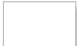
Half Page 7.5" x 4.75"