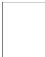
Quarter Page Vertical 3.75" x 4.75"