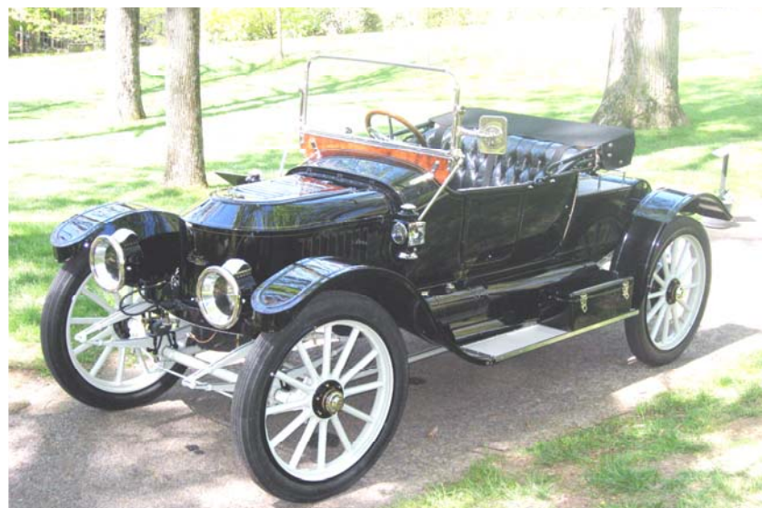
1913 Stanley Model 78 Roadster (Owned by the Marshall Steam Museum)