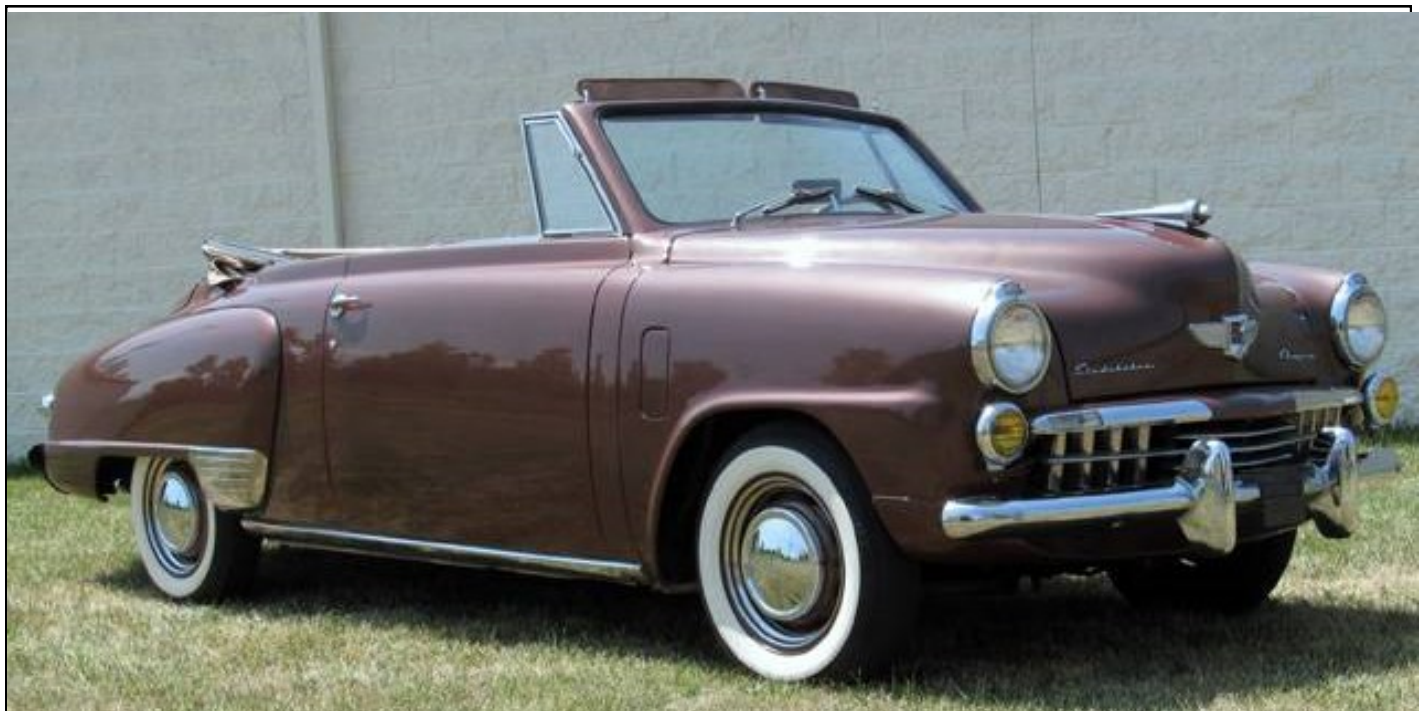
1948 STUDEBAKER CHAMPION CONVERTIBLE