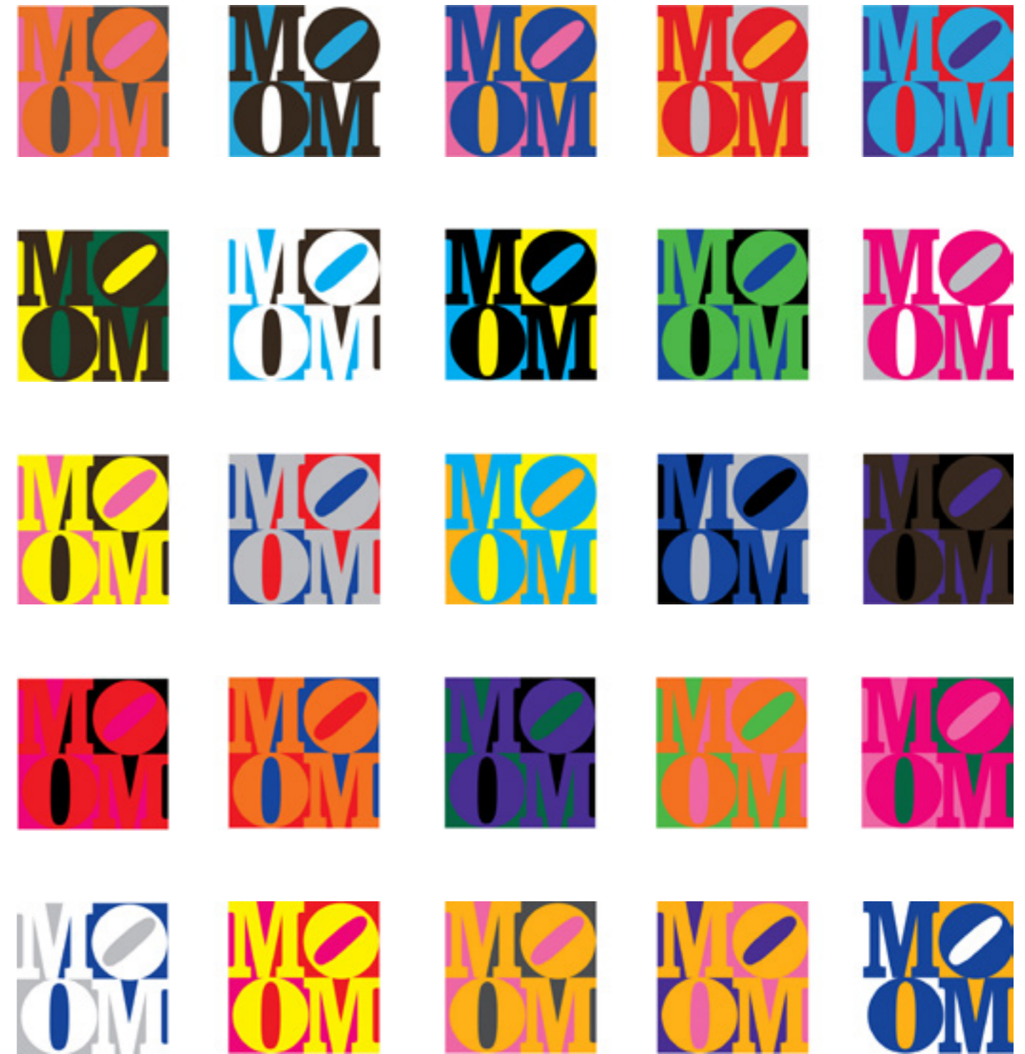
Romaric Tisserand 3360 TIMES (from M to O) (from the top:) n° 002 / 672, n° 103 / 672, n° 118 / 672, n° 213 / 672, n° 231 / 672 Sets consisting of 5 digital files Unique edition 1/1 + 1 AP Dimension of the materialized set: 5 times 40 cm x 40 cm 2014

A common idea connects both projects: the unity that is used as a module to be multiplied and combined. In Romaric Tisserand's case, the unity is the one created by the color. As for alban le henry, the unity in his installations arises from the stacking of the storage units.