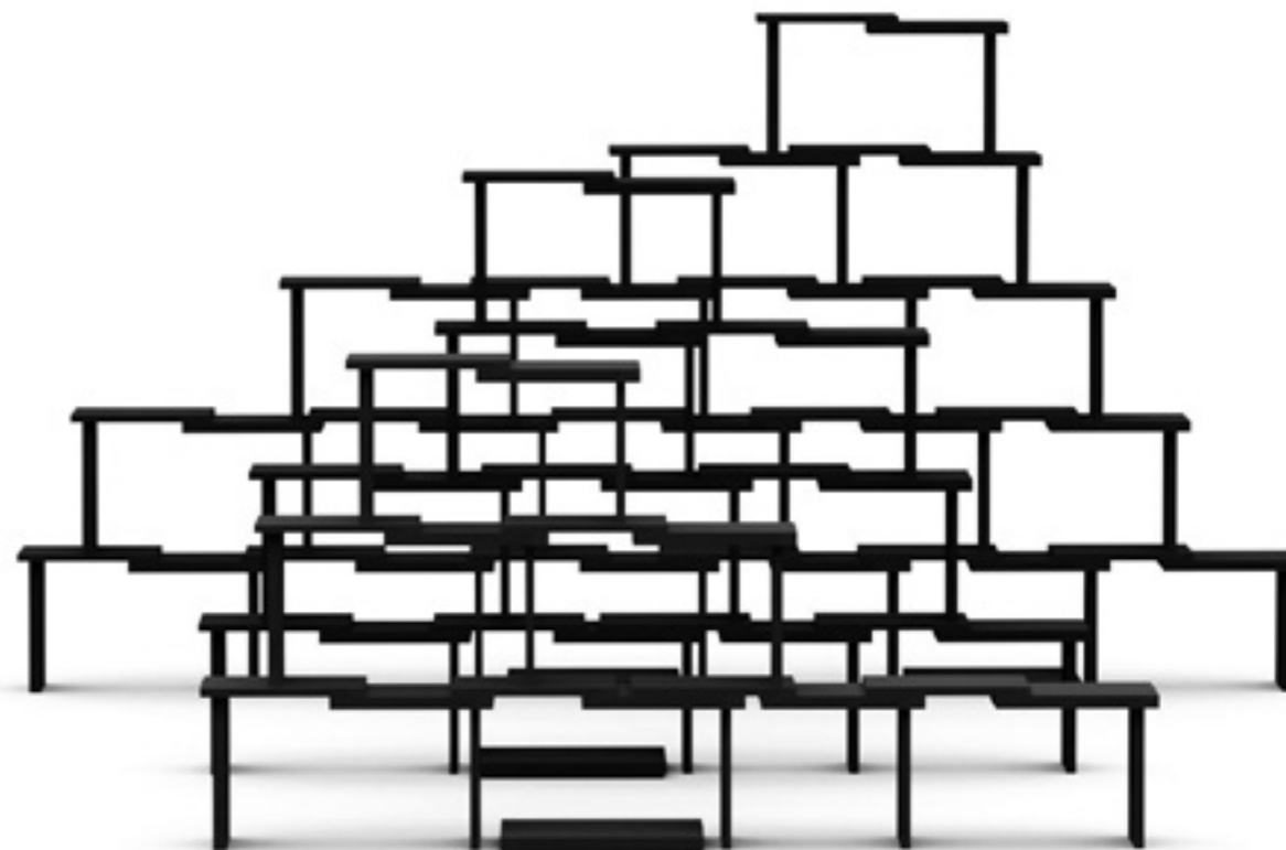
alban le henry stack Preparatory drawing 2014