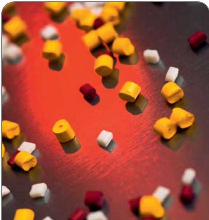
Powder and granules: a pneumatic conveyor for many uses