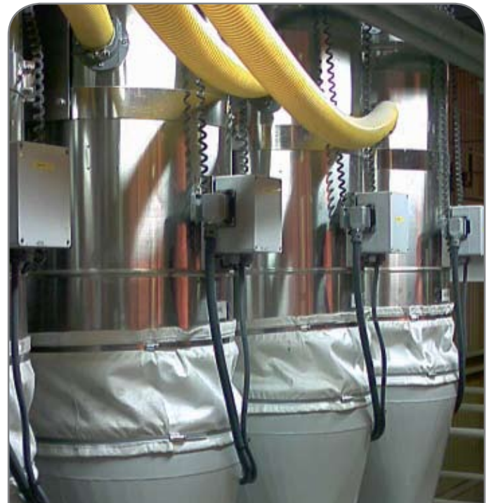
Feeding system on a plastic conveying process