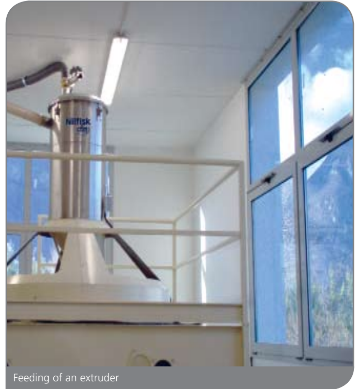
Feeding of an extruder

All the models in the pneumatic conveyors range are equipped with control panels that can be customized to a very high extent. Thanks to their power, the conveyors can achieve highly intensive production rates both in terms of speed and quantity. The material drawn in is filtered, making the working environment ultra-safe for the operator. All these features are essential for the most advanced production processes.