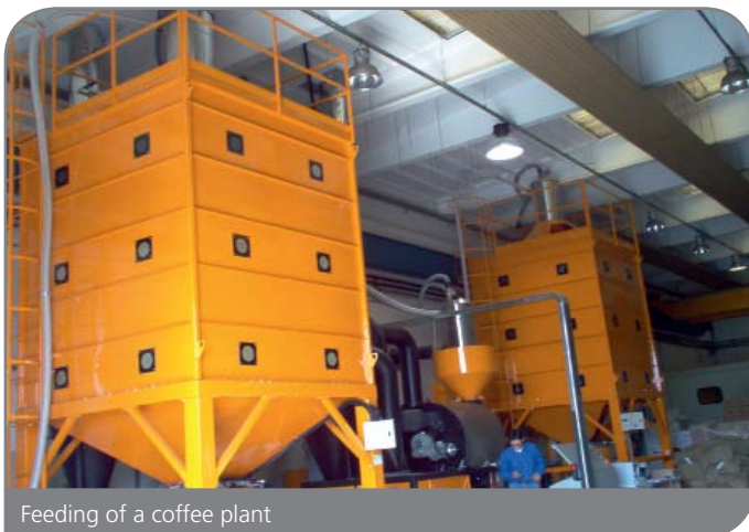
Feeding of a coffee plant