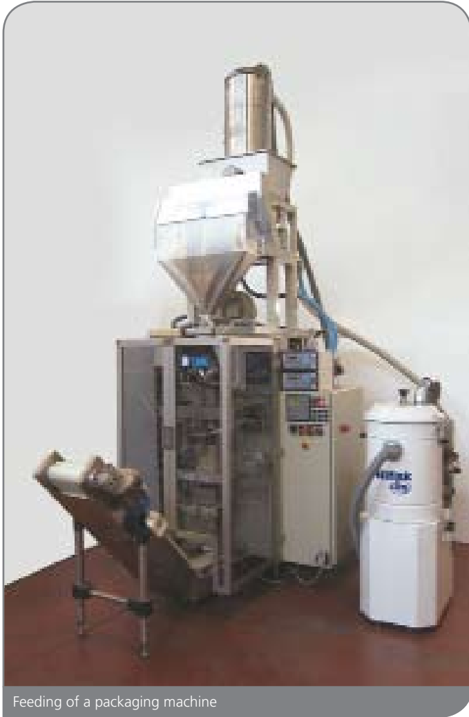
Feeding of a packaging machine

Part of the conveyor range has been specially designed for the food industry. Nilfisk-CFM has been chosen by the most important food producing companies to which it supplies suction systems. These include pneumatic conveyors for both powders and granules.