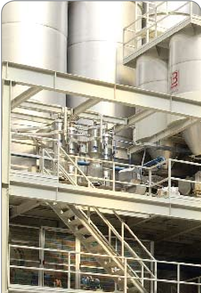
Feeding of installations

When it comes to ceramic tiles, pneumatic conveyors are widely used in the production process by companies who have made automation a major strategy. Pneumatic conveyors are used throughout the production phase for: