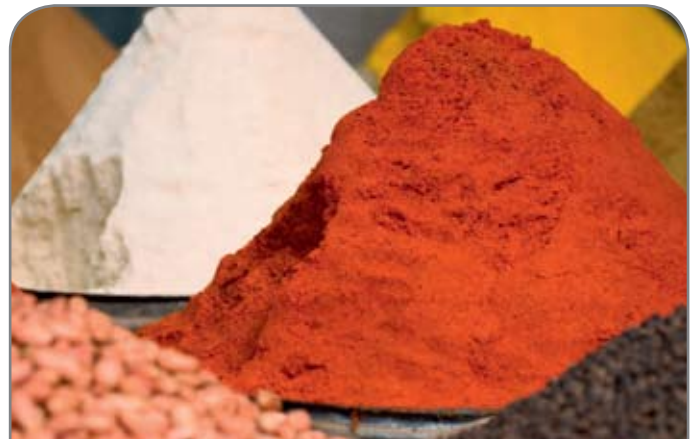
Efficiency and safety during the conveying of powders