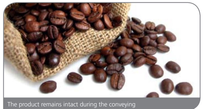
The product remains intact during the conveying