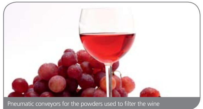
Pneumatic conveyors for the powders used to filter the wine

For roasting products, Nilfisk-CFM's pneumatic conveying system replaces the conventional conveying systems which uses belts, elevators, screws and so forth. Moreover it also prevents the products from being damaged and guarantees that they are treated in a hygienic way.