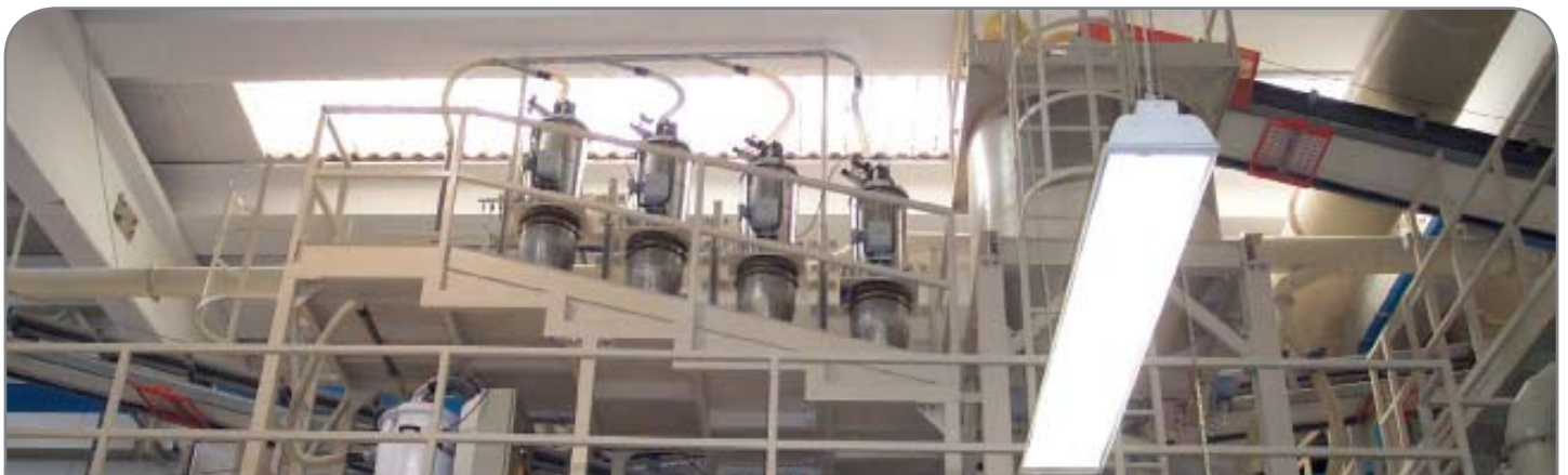
Feeding of colouring powders