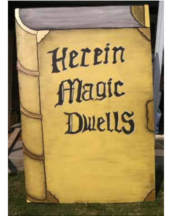
A giant book displayed at the Storybook Fair.

evaluating literacy through storytelling programs. Mountain Empire Literacy Outreach partners with a variety of local organizations, elementary schools, libraries, and senior centers. She conducted a needs assessment to ascertain the best program design for each location. For one location, a storyteller would present, and the audience was given time to create art, based on their interpretation of the story. Then, the audience members created their own stories based on their artwork.