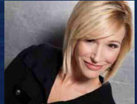
Pastor Paula White