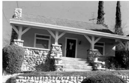
This Craftsman cottage on Holland was awarded by the HPHT in 2002 for sustained maintenance.

to the architectural integrity of the area? Don't forget the property that is consistently maintained in