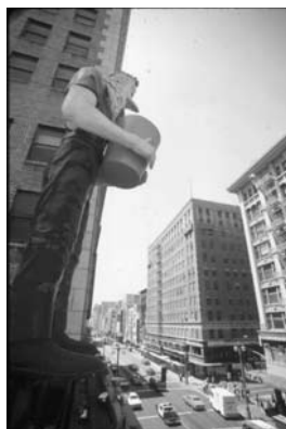
Chicken Boy on Broadway, 1970s.

He became my touchstone. I would drive by in the middle of the night and wave to him. I'd take out of towners to go wave. He was not just a marker for a fried chicken joint, he was a beacon of peaceful dignity intent on finding the silver lining of life. In time, I discovered I wasn't the only one who saw this in his being.