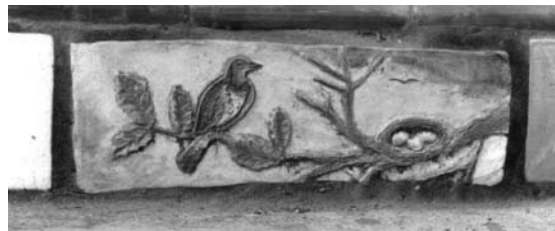
The Garvanza-San Pascual staircase was recognized by the HPHT in 2002 for its artistic tile that was done by local children as an art project.

Taking a short drive around your neighborhood might net some surprises and you may come up with not only one, but two or even more nominations.