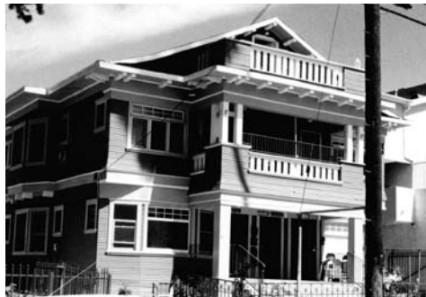
H. J. Moline Flats on Monte Vista St. received a 2004 HPHT award for a façade and restoration.

done something to their property that displays community pride? Has a new building in your neighborhood been constructed so as to be sensitive