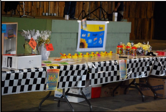
Duck Splash Ducks at the winner's table during the Fall Festival

This year the Main Street Fall Festival included a new, soon to be annual event called Duck Splash. Matthew 25:40 has added the innovative fund raiser to the events held on the Forked Deer River. Numbered rubber ducks were launched into the River from the Main Avenue bridge and traveled past the Farmers Market to a finish line near the floating canoe dock at