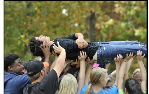
A classmate is literally lifted up by his peers after learning to trust them.

Twenty-five Dyer County Youth Leadership candidates participated in COPE or Challenging Outdoor Personal Experience at Camp Mack Morris near Camden, TN. Leaders learned to trust each other and work as a team as they completed various exercises on the ground and 40 feet in the air. COPE challenges 10th graders from Dyer County and Dyersburg High School to develop problem solving skills involving creative thinking, planning and cooperation. Youth Leadership is sponsored by First South Bank allowing competitively selected participants to complete the 7-month course for free. To simulate the job application process, students are judged solely on the content of their applications to the Leadership program. Judges poured over some 100 applications to choose the Youth Leadership Class of 2012-2013. Youth leaders will join their counterparts in the Adult Leadership program on November 6th for the annual Diversity/Entrepreneurship Day at the Lannom Center.