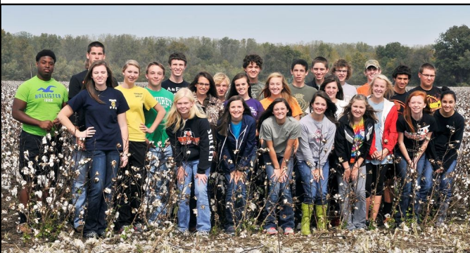
Youth Leaders strike a pose in a cotton field on Bradley Road.