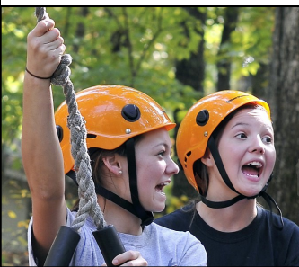
Youth leaders utilize communication skills they learn during leadership training at Camp Mack Morris.

Twenty-five Dyer County Youth Leadership candidates participated in COPE or Challenging Outdoor Personal Experience at Camp Mack Morris near Camden, TN. Leaders learned to trust each other and work as a team as they completed various exercises on the ground and 40 feet in the air. COPE challenges 10th graders from Dyer County and Dyersburg High School to develop problem solving skills involving creative thinking, planning and cooperation. Youth Leadership is sponsored by First South Bank allowing competitively selected participants to complete the 7-month course for free. To simulate the job application process, students are judged solely on the content of their applications to the Leadership program. Judges poured over some 100 applications to choose the Youth Leadership Class of 2012-2013. Youth leaders will join their counterparts in the Adult Leadership program on November 6th for the annual Diversity/Entrepreneurship Day at the Lannom Center.