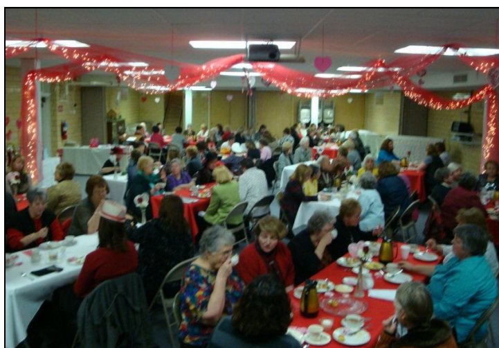
Photos from Millstadt Civic Club's 1st Place Float at the 2012 Millstadt Homecoming (left) and Annual High Tea fundraiser (right).