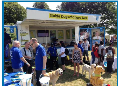
Redbridge Training School

Come and celebrate the 30 th anniversary of the Redbridge Training School on Saturday, 3 September, from 11am–4pm. All of the usual fun day activities will be there, and there will be some new surprises. Entry is £2 for adults and free for children, but pet dogs are not allowed on site. Offsite parking is available nearby at West Hatch School, postcode IG7 5BT. For more information, call 0118 983 8802 or email redbridge@guidedogs.org.uk .