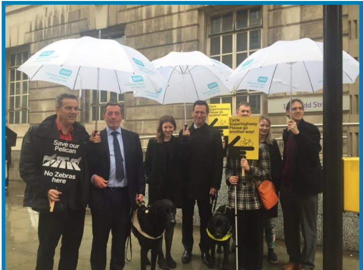
The rain won't stop the campaign!

Guide Dogs campaigned with the RNIB outside their Judd Street offices to highlight plans by Transport for London to remove a zebra crossing as part of a cycle superhighway extension. Guide dog owners David Blunkett and Lord Chris Holmes were among those who braved the rain. We are yet to hear whether the calls for action will pay off.