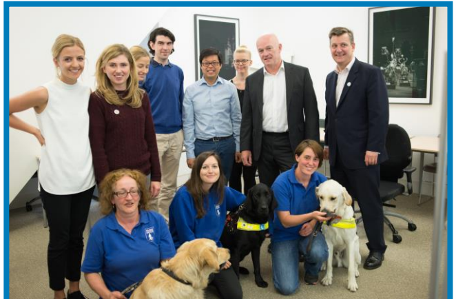
Staff from Herbert Smith Freehills

We visited the corporate law offices of Herbert Smith Freehills near Liverpool Street on 20 May during Mental Health Awareness Week, to trial the Meet Guide Dogs in the London area. Each staff member was given a 10-minute time slot to meet the dogs and learn more about Guide Dogs. With help from puppy walkers and Guide Dog Trainers from the Redbridge Training School, we were able to raise £1,471.35 in just two hours.