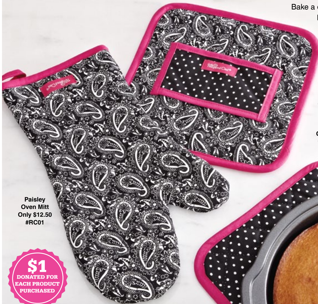
Paisley Oven Mitt Only $12.50 #RC01

Bake a difference with NEW pink products – in May only! – to benefit the American Cancer Society's breast cancer awareness and early detection programs.