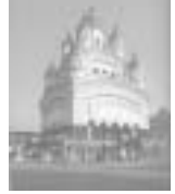
KOLKATA - 2006

Please return this form along with expanded abstract to : KOLKATA - 2006 Secretariat 1, Old CSD Building, KDMIPE Campus, Kaulagarh Road, Dehradun (Uttaranchal) India-248 195 email : spgindia@rediffmail.com Due date for expanded abstract Aug 31, 2005