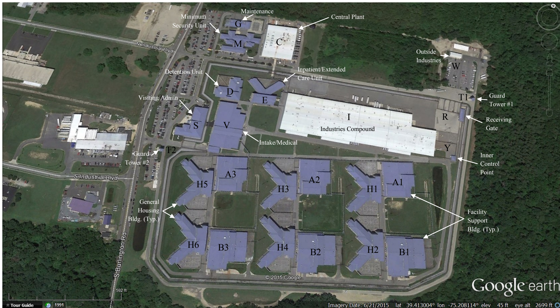
Site Map - South Woods State Prison