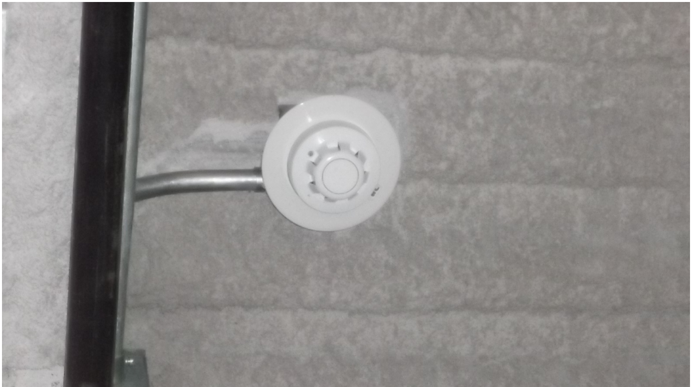
Another example of an original Grinnell smoke detector (To be replaced) typical of those installed throughout the facility. This one installed in the ceiling of the mechanical room in Building A3.