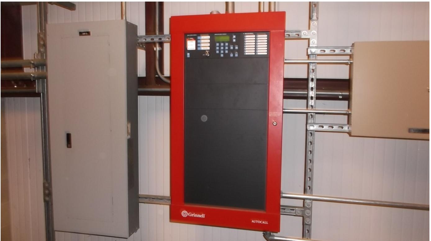
An original Grinnell fire panel located in Building A3 (To be replaced).