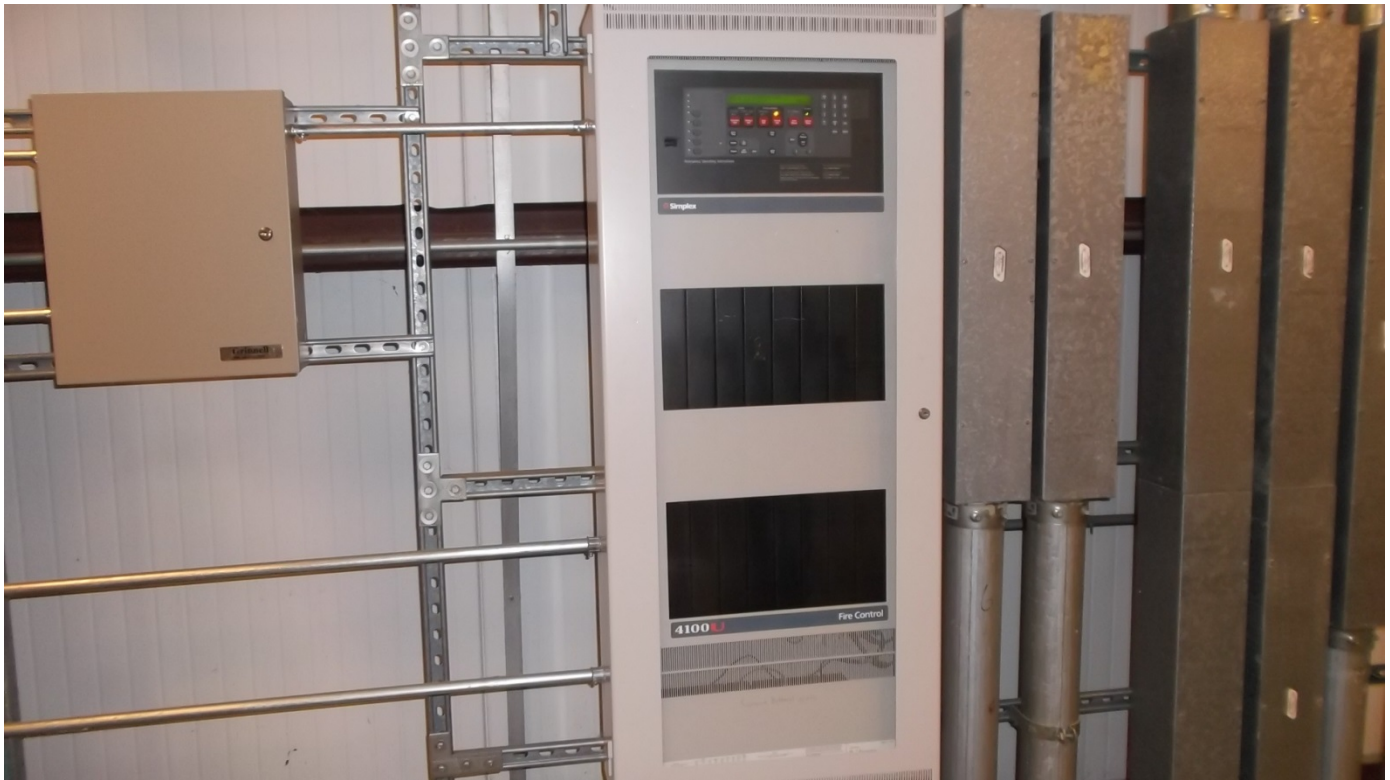
A new Simplex fire control panel interfaced into existing system and located in Building A3.