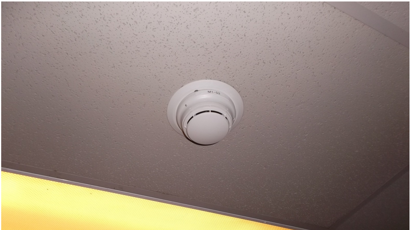
New smoke detector typical of those installed in Buildings A1, A2 and A3 replacing old "A" loop detectors. Now known as part of "M" loop.