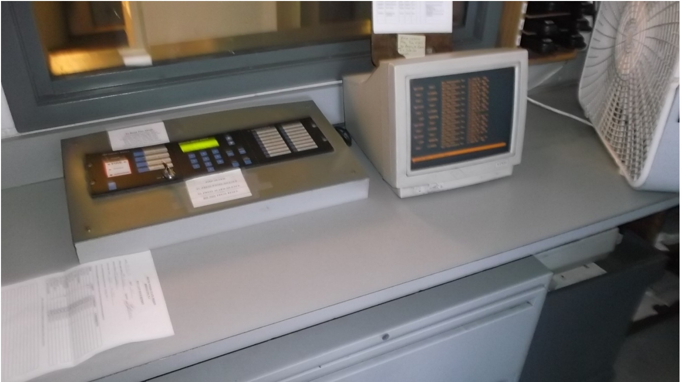
Main monitoring station with display in Building V (To be replaced).